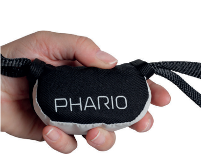
Lightweight and compact size.