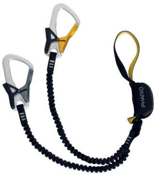
PHARIO 360° C2321BX00