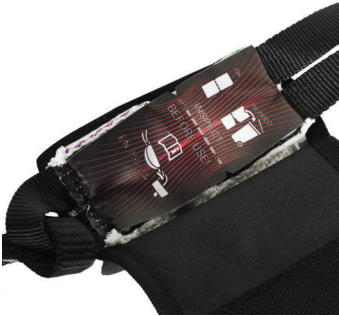
Fall indicator label helps to detect if the shock absorber has already been activated and needs to be replaced.