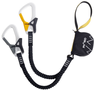
PHARIO PALM C2317YB00