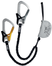
PHARIO LITE (C2319YB00)

Lifetime of this product depends on the frequency and the environment (salt, sand, moisture, chemicals, etc.) in which is used. Without taking wear or mechanical damage into account and in compliance with the conditions specified in the instructions for use this product may be used 15 years from the date of production and 10 years from the date of the first use. However mechanical damage can occur during the first use, which can limit the lifetime of this products only to its first use.